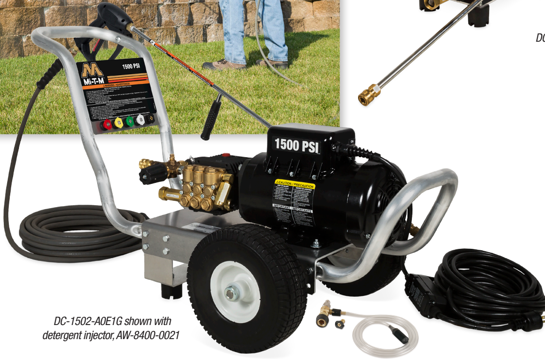
DC-1502-A0E1G shown with detergent injector, AW-8400-0021